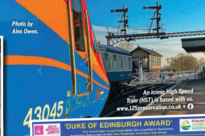
An iconic High Speed Train (HST) is based with us. www.125preservation.co.uk + f