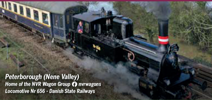
Peterborough (Nene Valley) Home of the NVR Wagon Group nvrwagons Locomotive Nr 656 - Danish State Railways